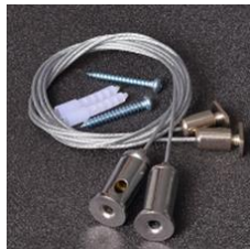
Suspension steel cables