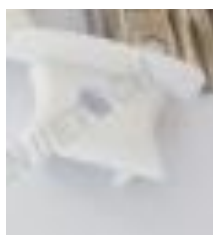
White End Cap