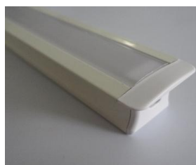
White Paint Finishing