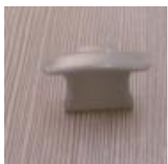
Grey End cap