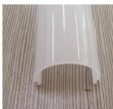
Frosted PC Cover