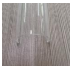
Clear PC Cover