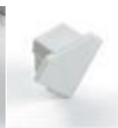
Grey End caps