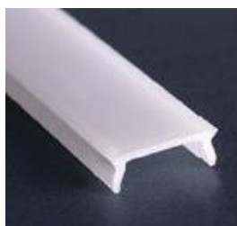
Press Down Covers