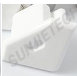
White End caps