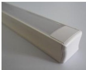
White Paint Finishing