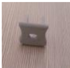
Grey End cap