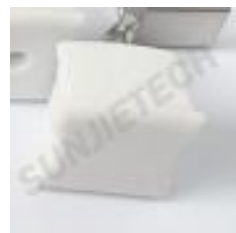
White End Cap