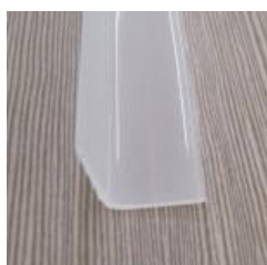
Frosted PC Cover