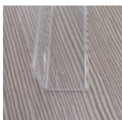
Clear PC Cover