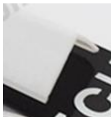
Milky PC Cover