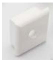
White End caps