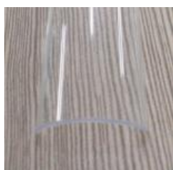
Clear PC Cover