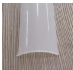
Frosted PC Cover