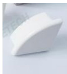
White End caps