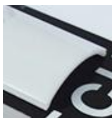
Milky PC Cover